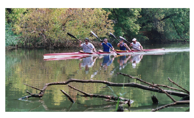
A kayak race on the Elm Fork.

The thousands of acres that comprise the Trinity watershed as it passes through Fort Worth and Dallas constitute a potential environmental treasure virtually unparalleled in urban America. Comparable environments are such places as the 70 mile long Golden Gate National Recreational Area near San Francisco, and the 20,000 acre Metropolitan District Commission Reservations in eastern Massachusetts. This is the scale at which the entire Trinity enterprise should be considered, with the area encompassed by this plan serving as its heart. By comparison, Denver's South Platte River Park (see next page), as impressive as it is becoming, constitutes less than half of the acreage of the Trinity floodway.