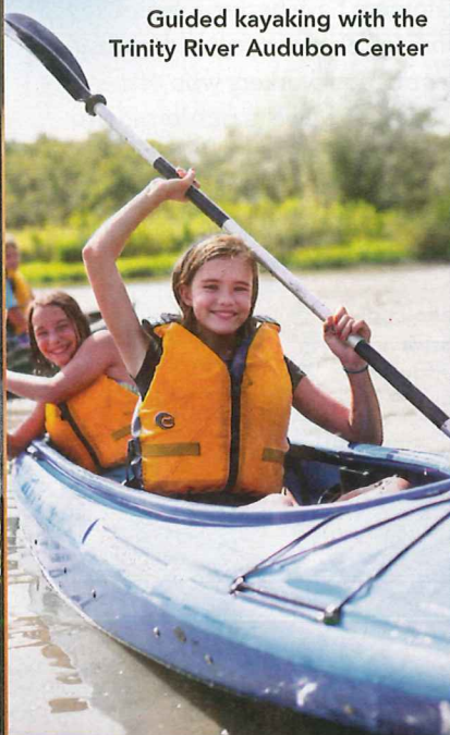
Guided kayaking with the Trinity River Audubon Center

The wetlands are home to many bird species, and the center's two-hour bird-watching classes will help you learn to identify them. An evening version called an Owl Prowl teaches how to hoot and attract these nocturnal birds to your yard. (214) 398-8722; trinityriver.audubon.org .