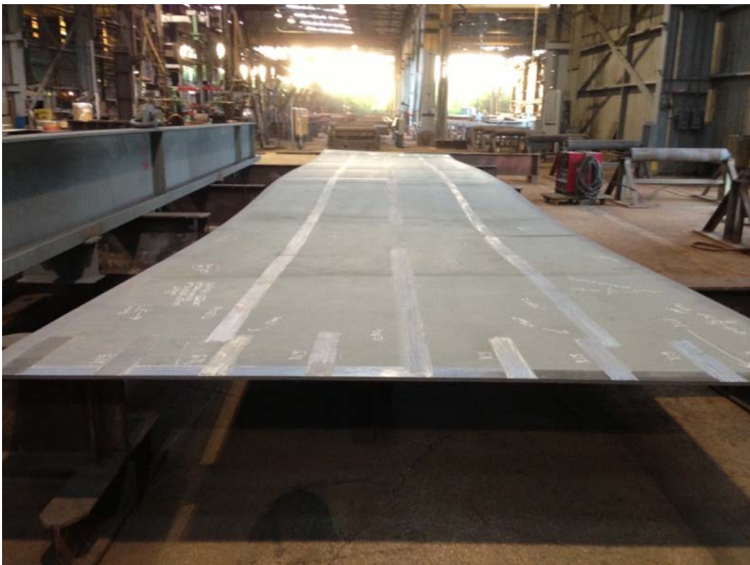
Arch Segment EA12 bottom flange plate.