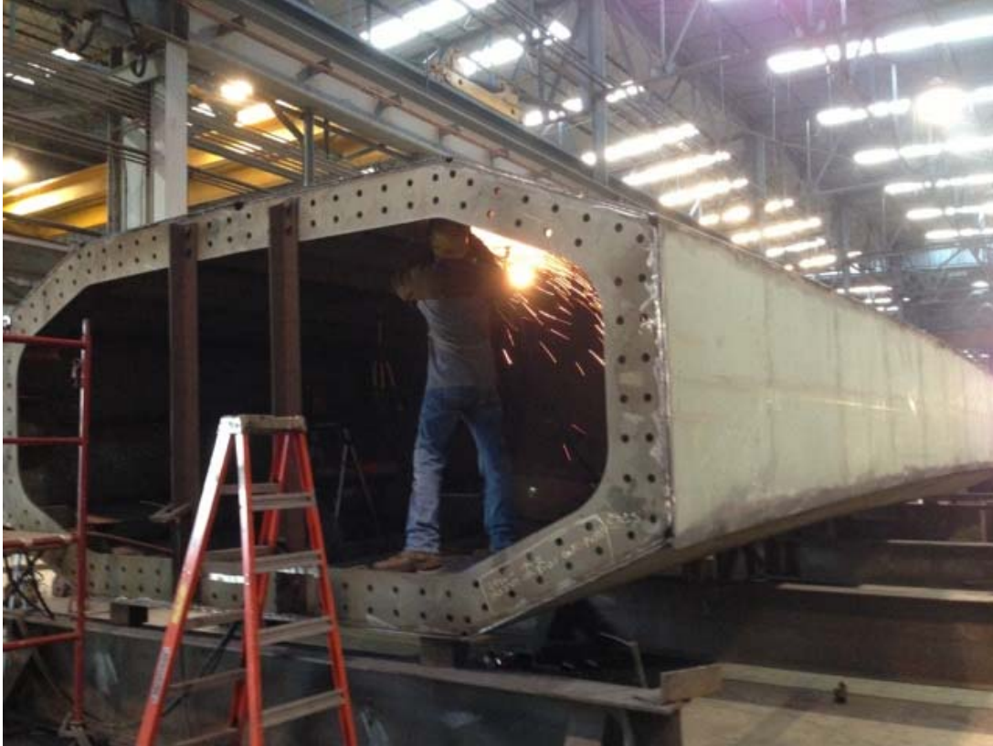
Arch Segment WA10 in assembly.