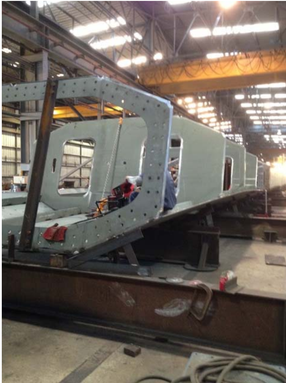
Arch Segment EA11 in assembly.