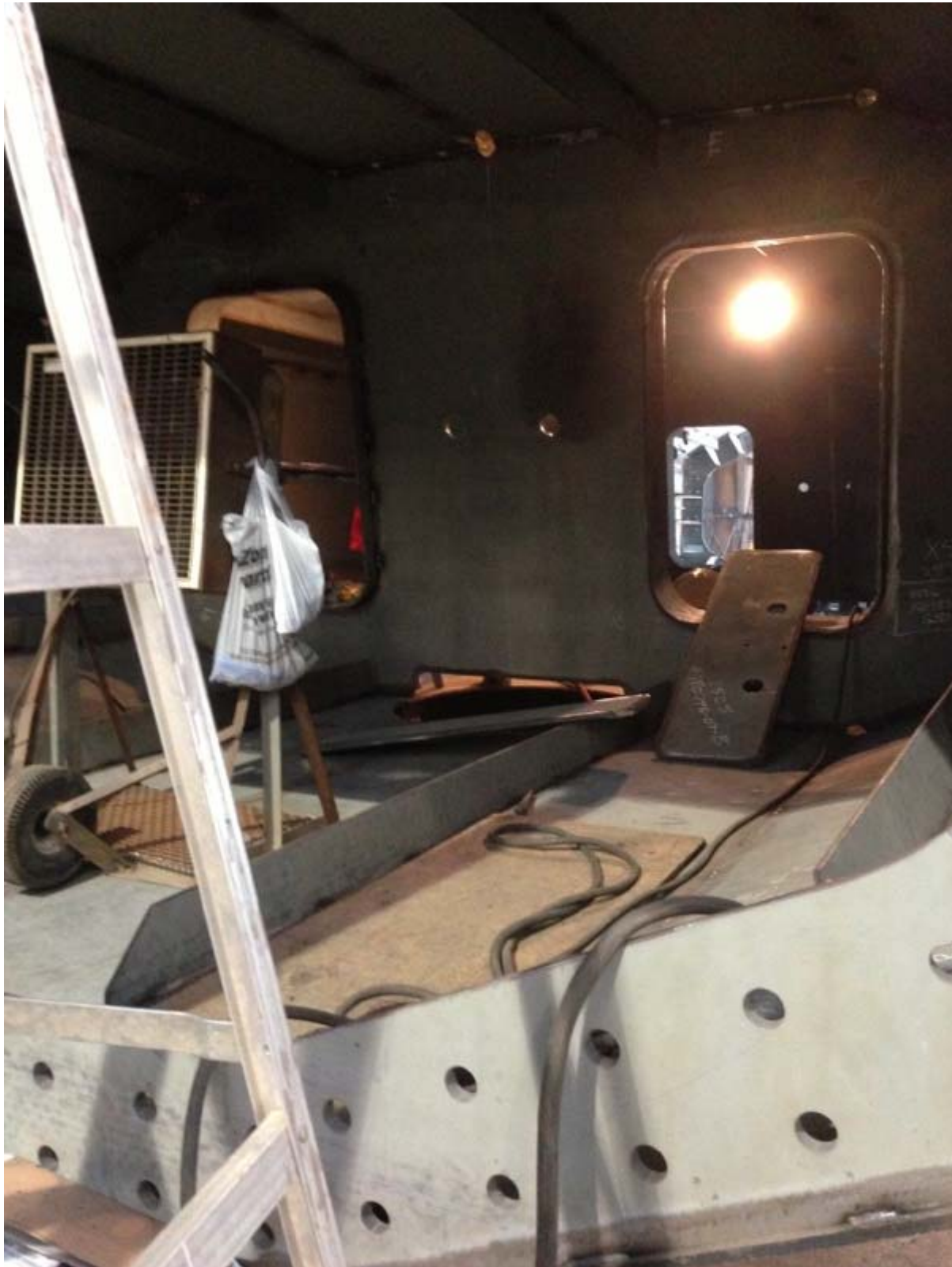
Arch Segment WA12 – fitting cable diaphragm enclosures.