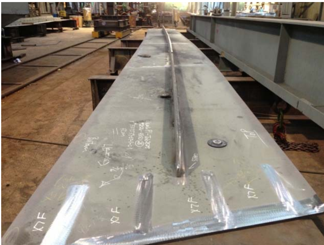
Arch Segment EA11 skin plate "C".