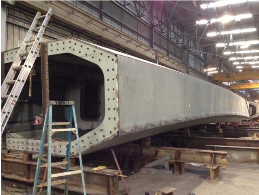
Arch Segment A14 tack-welded together.