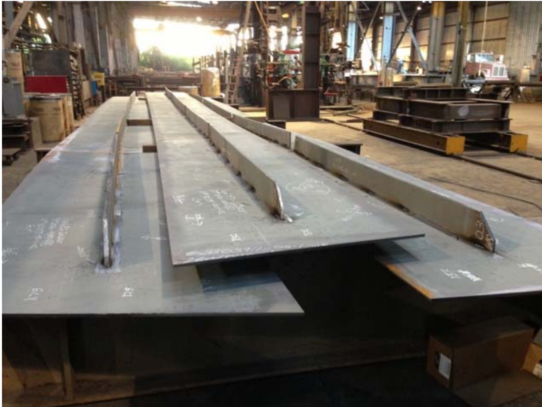
Arch Segment EA11 skin plates with stiffeners.