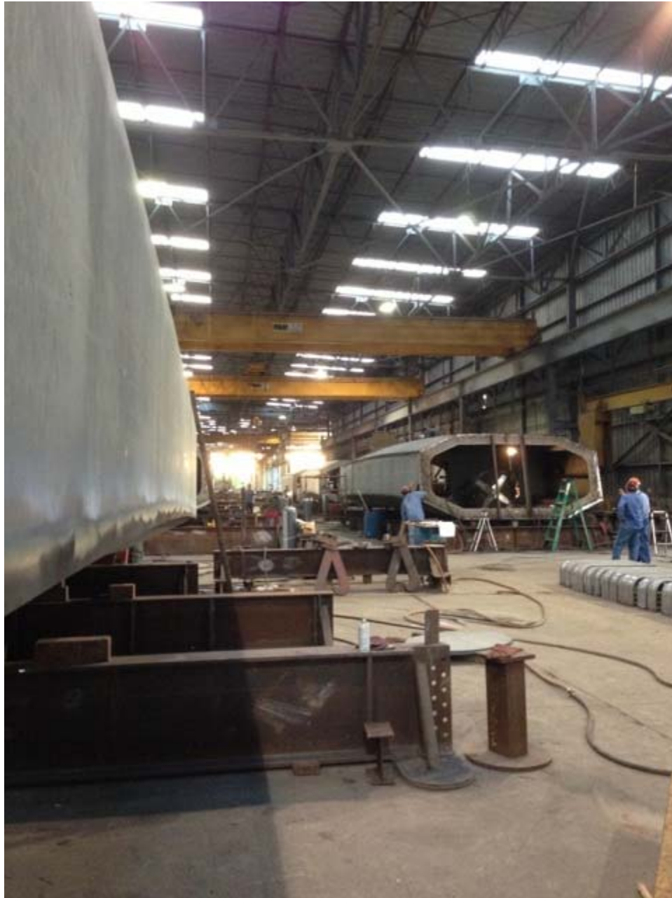
Overview of Arch Segments in fabrication.