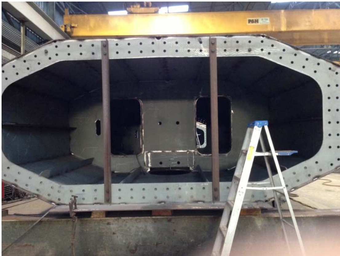
Arch segment EA13.