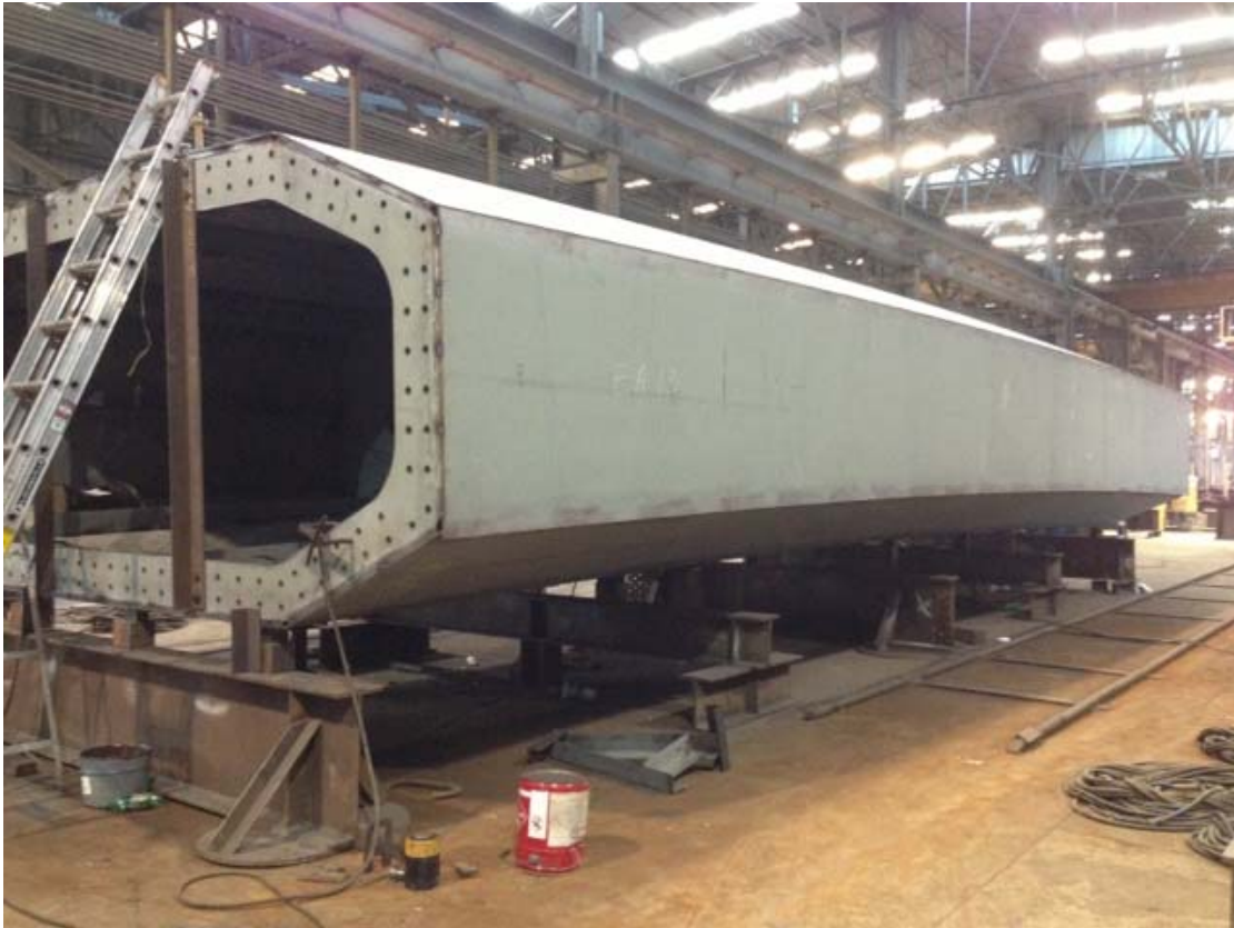
Arch Segment EA13 in assembly.