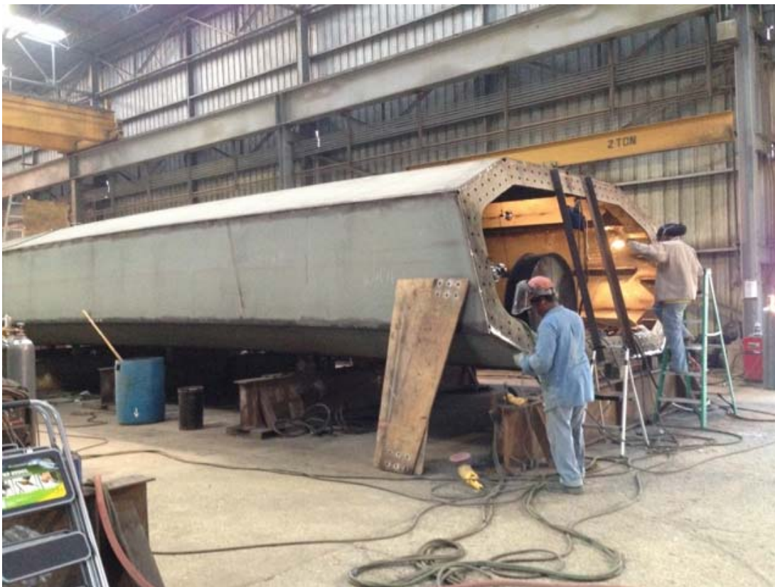
Arch Segment WA11 – prepping to grind end field splice diaphragm.