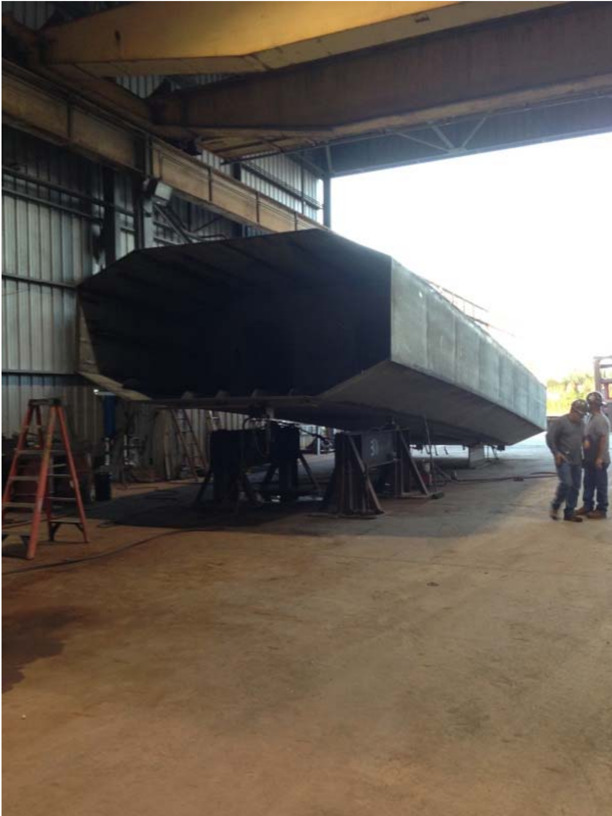
Arch Segment WA8, blocked up for segment assembly.