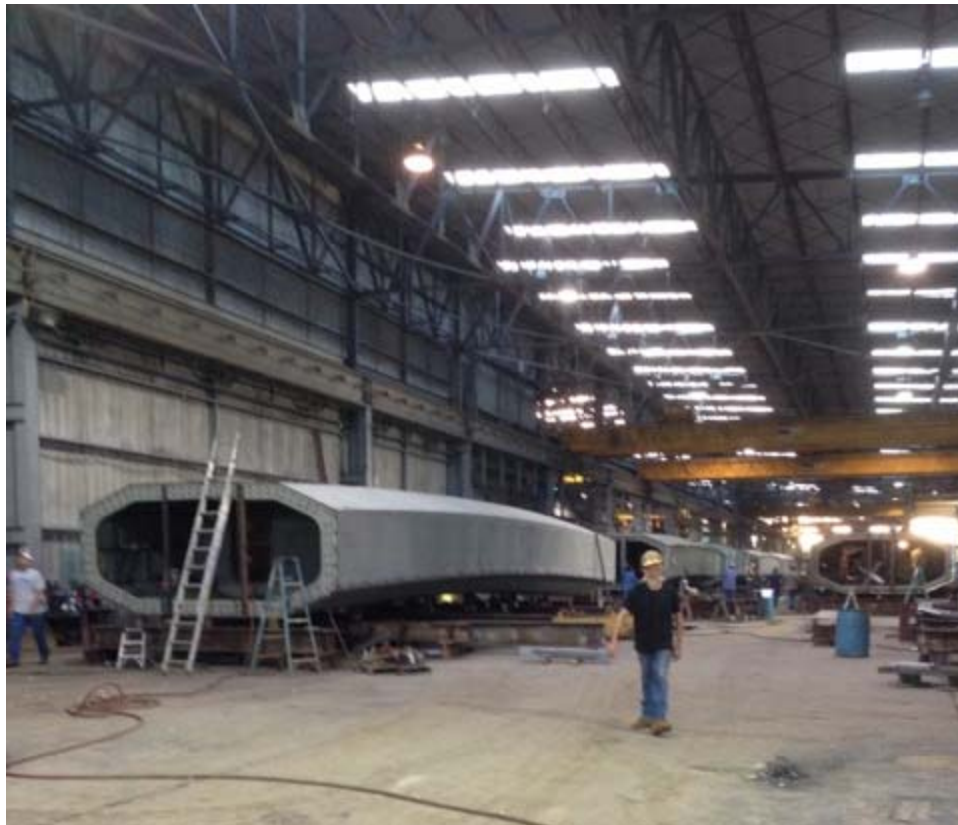
Overview of Arch Segments in fabrication.